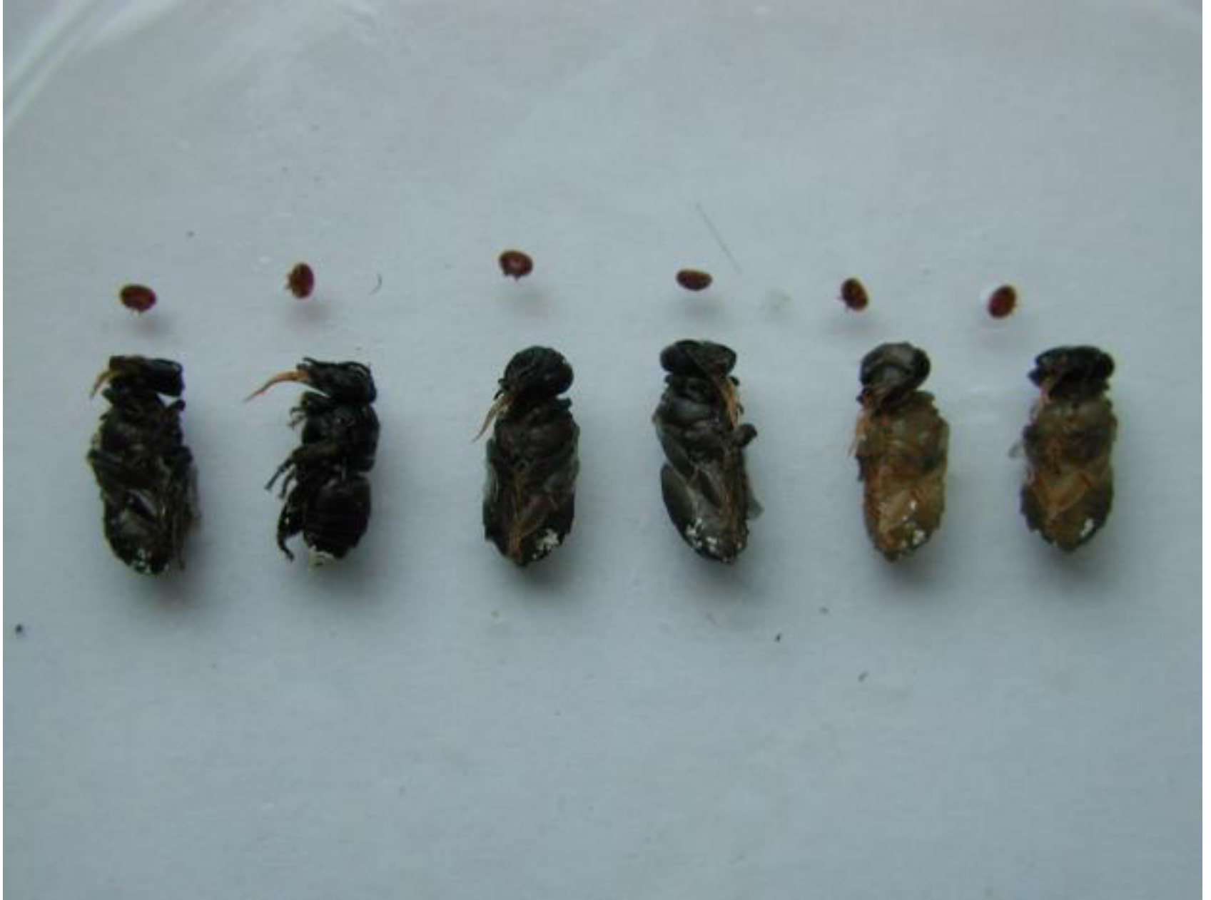
Fig. 3. Sterile mites with defecation on bee abdomen. All these six mites did not reproduce and all had defecated on the Apis cerana workers. This is also true in Apis mellifera : if a mite has defecated on the pupae, she would have no daughters. If she has daughter mites, she would be defecating on the wall.