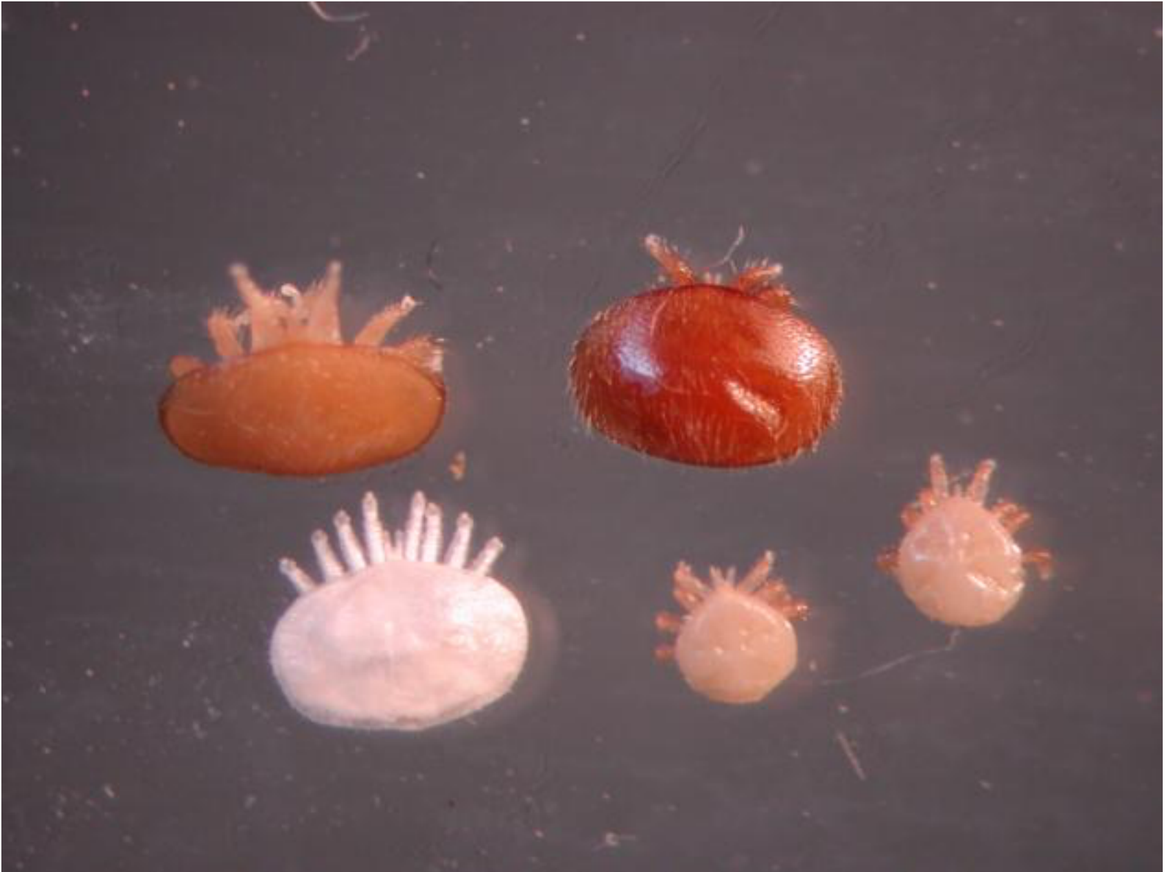
Fig. 2. Mature, immature females and mature males of Varroa. Clockwise from top left: mature daughter mite, mother mite, two mature males and an immature (deutonymph) daughter. A younger stage (protonymph) of female is not in this photo.

Varroa mites have “fecal sites” on the cell, where they deposit their feces, which are white due to a high concentration (~95%) of guanine. For some unknown reason, any mite that defecates on the pupa directly are also sterile (Fig. 3).